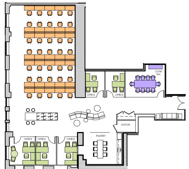
Test Fit – 5 Offices